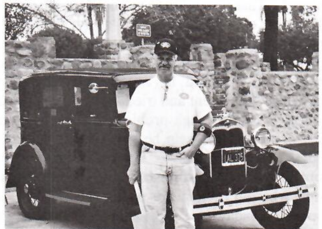
Mr. Parking Lot Control!