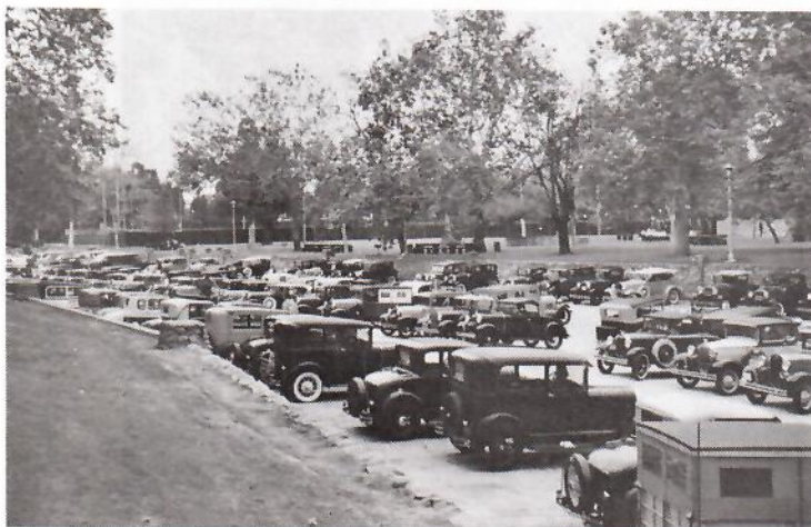
Model A's All Over The Place!