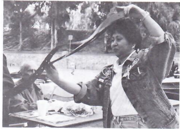
Ticket Sales Were Flying High!

The car show and breakfast was a huge success. Our club can be very proud for this year's event gave us more Model A Fords on display and more individual breakfasts served than ever before! And how smooth every phase went. Thanks to everyone for the teamwork and the many individual efforts to make this very special event run like clockwork. This year we served 1,453 breakfasts. Model A,s registered for the car show numbered 252, with an additional 30 that showed up, but didn't register. There were also 21 other assorted vintage cars present. ☺