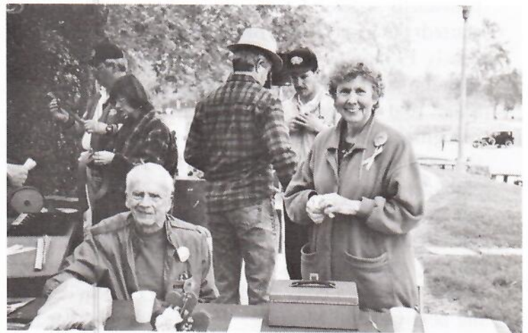
Extra Special Ticket Sellers!